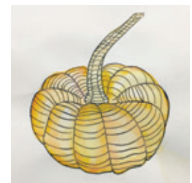
Tyler Casarez, Cross Contour Line